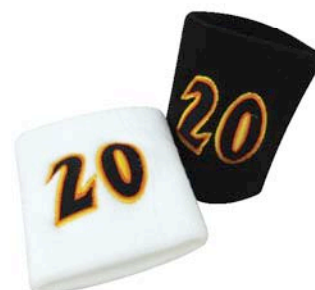
Shown with optional embroidery