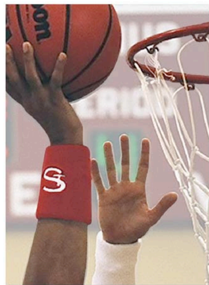
Worn By The Pros