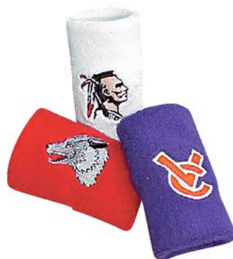
Shown with optional embroidery

4400 Ultimate Wristband Approx. 3 1/2" long Sold in pairs