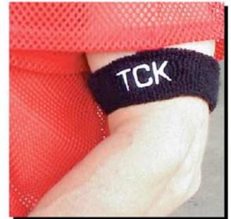
Shown with optional embroidery. See pages 41 to 44.

Special order only , minimum order 12 each. Available to ship within 1-2 weeks.