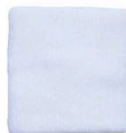
BACK Option A