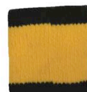
BACK Option B