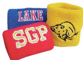
Shown with optional embroidery