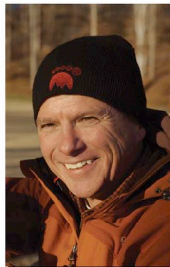
ICS30 & IACS