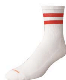
White with Stripes