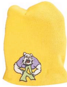
Shown with optional embroidery, see pages 41 to 44.