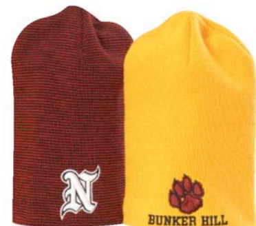
Shown with optional embroidery, see pages 41 to 44.

Special orders can be made with a minimum order of 1 dozen per size, name/logo, and color. Special orders will be shipped and invoiced with a 10% variance over or under the original quantity ordered, order accordingly. Available to ship within 4-6 weeks.