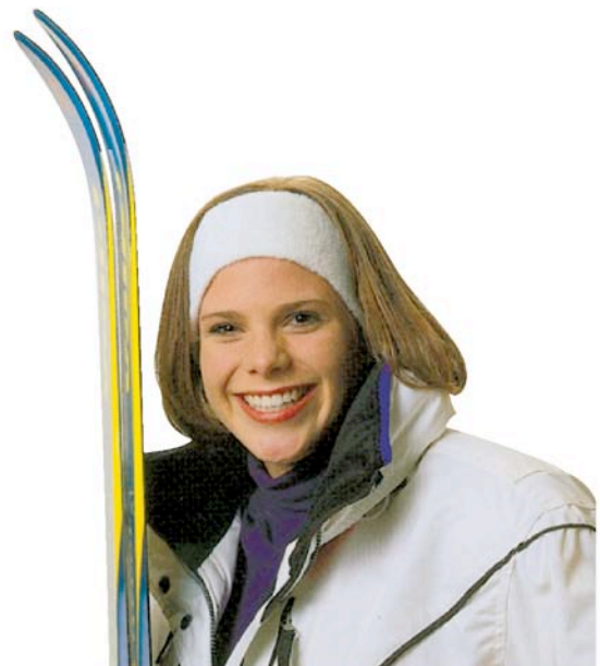
Embroidery options available, see pages 41 to 44.

Minimum order: 1 dozen on special colors