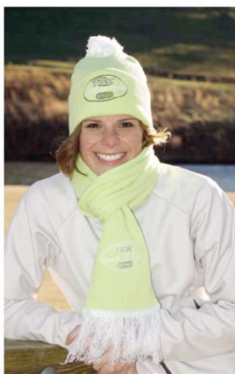
ICS30 & IACS

All special orders MUST BE MAILED or FAXED to Twin City.