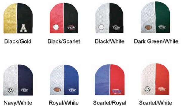
Shown with optional embroidery, see pages 41 to 44.