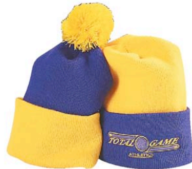
Shown with optional embroidery, see pages 41 to 44.