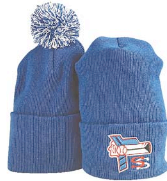
Shown with optional embroidery, see pages 41 to 44.