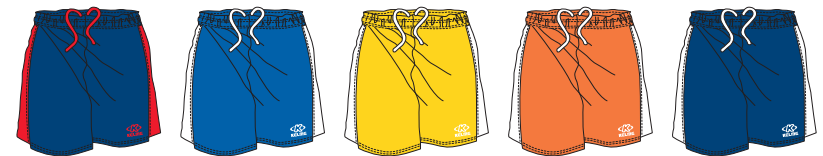
181 navy/red 196 royal/white 200 gold/white 209 orange/white 179 navy/white