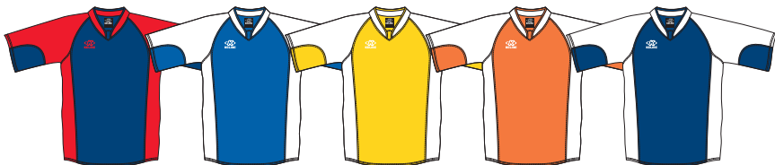
181 navy/red 196 royal/white 200 gold/white 209 orange/white 179 navy/white