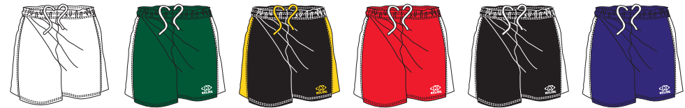
6 white 92 forest/white 91 black/gold 129 red/white 138 black/white 128 purple/white

Model: 78178 Material: 100% Polyester with Air Flow Mesh Sizes: YM / YL / S / M / L / XL MSRP: $26.00