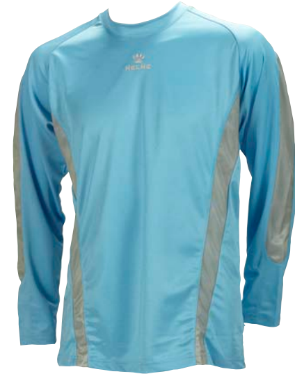
510 sky blue