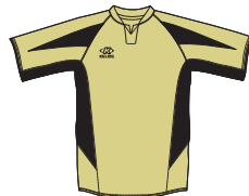
556 vegas gold/black

Model: 78158GK Material: 100% Brush Polyester Sizes: S / M / L / XL MSRP: $44.00